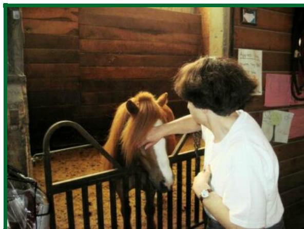
This pony is so adorable.